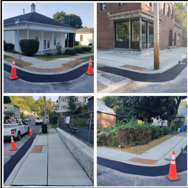
Accessible curb cuts in Kingston.

Construction is expected to begin in June and continue through December 2026.