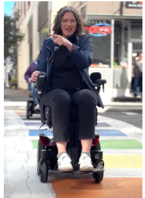
Ulster County Executive Jen Metzger recently toured the streets of uptown in a motorized wheelchair, learning firsthand the difficulties that exist.

The project will also include enhanced bump-outs at Main and Wall Streets, rapid flashing beacons near the Boys and Girls Club on Greenkill Avenue, and new bluestone sidewalks surrounding Academy Green Park.