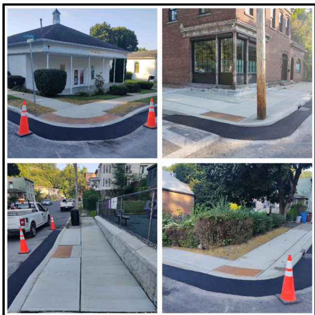
Accessible curb cuts in Kingston.

Construction is expected to begin in June and continue through December 2026.