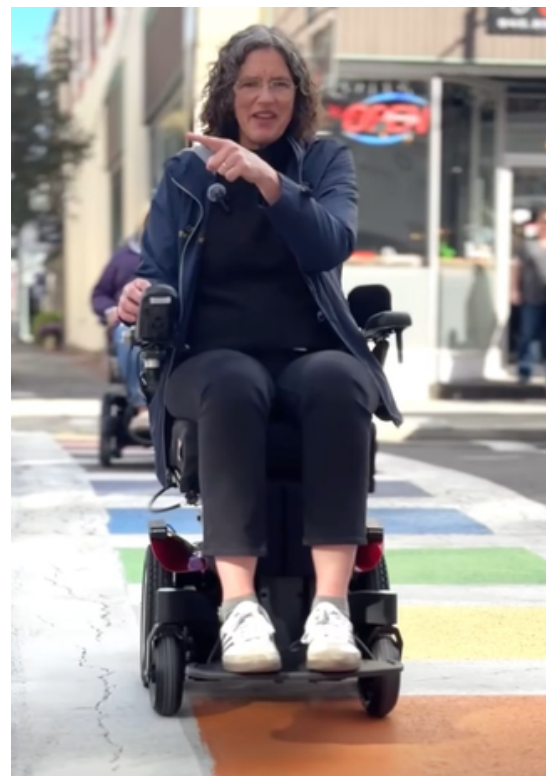
Ulster County Executive Jen Metzger recently toured the streets of uptown in a motorized wheelchair, learning firsthand the difficulties that exist.

The project will also include enhanced bump-outs at Main and Wall Streets, rapid flashing beacons near the Boys and Girls Club on Greenkill Avenue, and new bluestone sidewalks surrounding Academy Green Park.