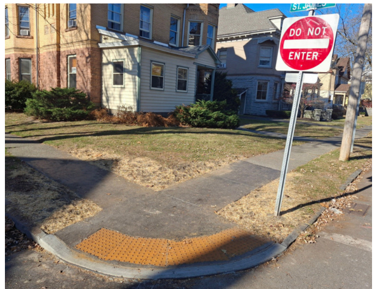
showing recently improved curb cuts.