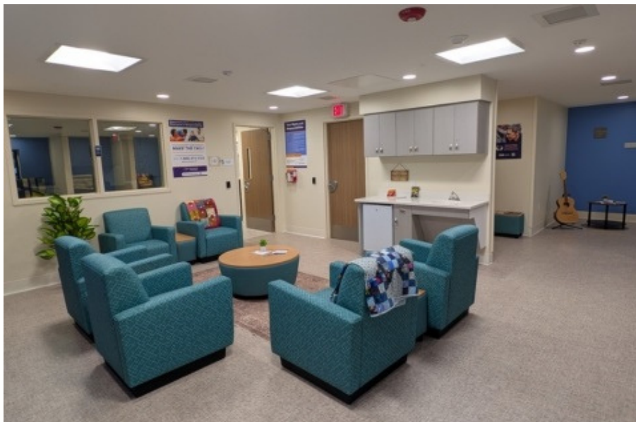
Ulster County’s Crisis Support Center in Kingston.